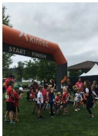
For more information, visit www.goldenspike.ca Subject to change. Parking is limited.

Register at: https://www.goldenspike.ca/volunteer 604.931.8852